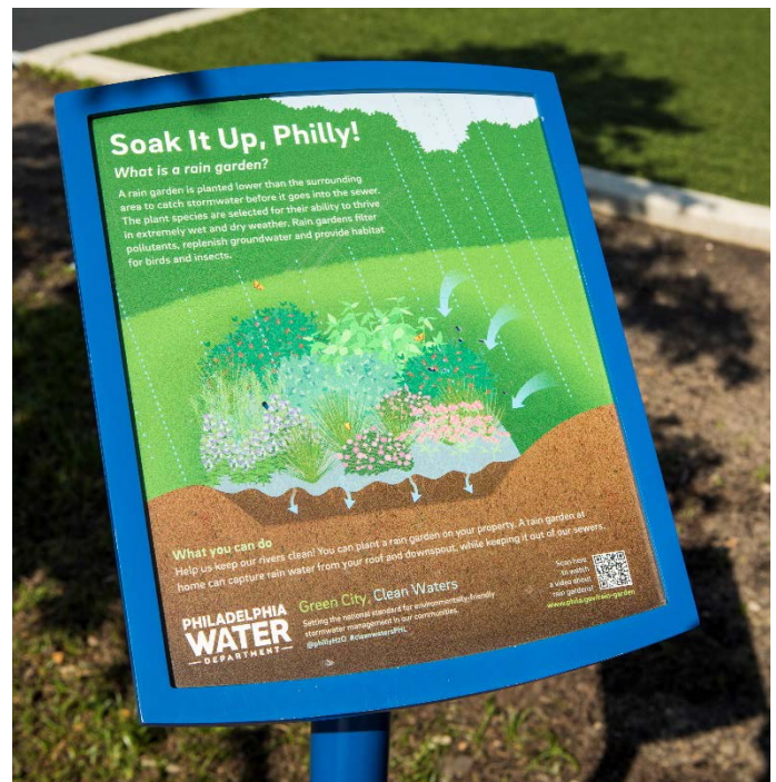
EM Stanton Elementary School in South Philadelphia

The Environmental Justice Government-to-Government (EJG2G) program provides funding at the state, local, territorial, and tribal level to support government activities that lead to measurable environmental or public health impacts in communities disproportionately burdened by environmental harms. Government recipients must have a community-based organization as a partner and build robust collaborative processes throughout the duration of the project. $20 million is reserved for states, $20 million for local governments, $20 million for tribes, and $10 million for unaffiliated state-like entities without reasonable access to a community-based organization.