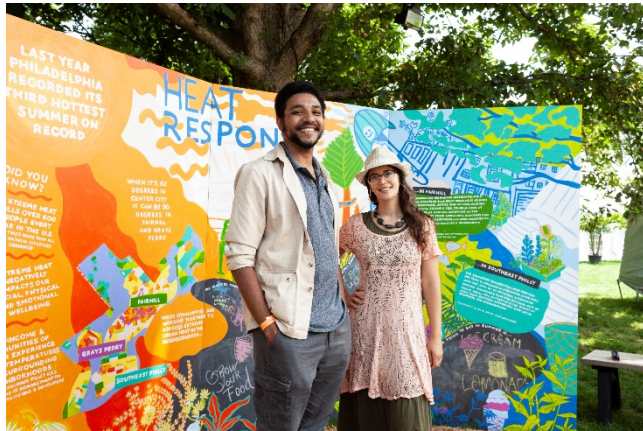
Trust for Public Land's Heat Capture display at the 2021 PHS Flower Show at FDR Park in South Philadelphia

Our Town is the NEA's creative placemaking grants program. Through project-based funding, the program supports activities that integrate arts, culture, and design into local efforts that strengthen communities. Our Town projects advance local economic, physical, or social outcomes in communities, ultimately laying the groundwork for systems change and centering equity. Program funds have been utilized in many outdoor recreation settings, providing aesthetic, cultural, and practical installations to parks. These projects require a partnership between a nonprofit organization and a local government entity, with one of the partners being a cultural organization. Grants range from $25,000 to $150,000, with a minimum 1:1 match.