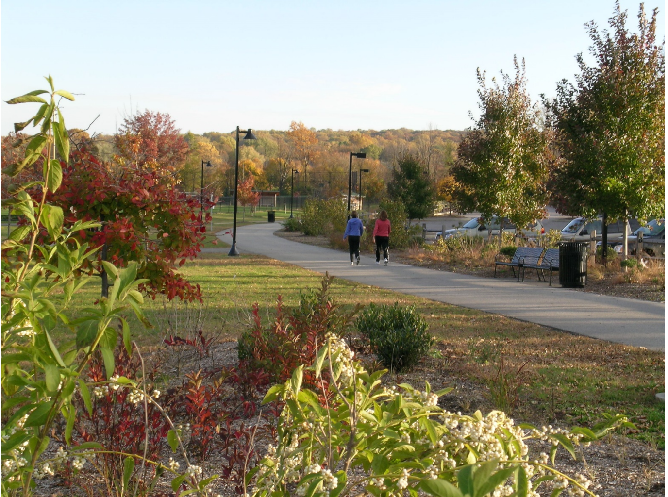
Chester County, PA, Wilson Farm Park, PA

Trust for Public Land envisions a future where every community has safe, equitable access to a high-quality park within a 10-minute walk of home. The 10-Minute Walk Program is one way we work – in collaboration with cities and partners – to address the most pressing questions and challenges to park equity. Launched in 2017, we are an award-winning national effort to improve safe, easy access to parks and green spaces.